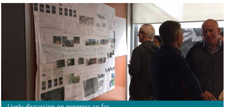
Lively discussion on progress so far

Harnessing and co-ordinating all the complex elements of a project of RiverLink's scope is no mean feat. So reaching its first development milestone – the completion of 30 per cent of the initial design phase was a real achievement.