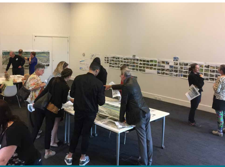
RiverLink Community Design Workshop held on Saturday 1 October 2016